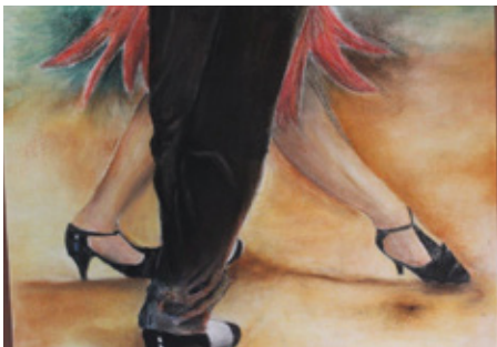
Mia Bou Zeidan (Grade 6 - Level I)