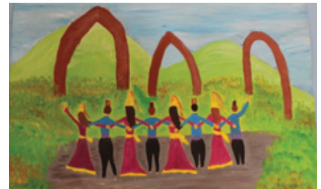
Riwa Abou Akl (Grade 6 - level I)