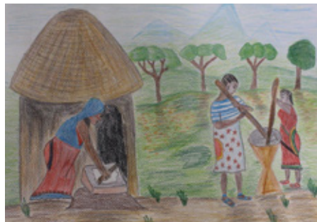
Chadi Tebchrany (Grade 4 - Level G)