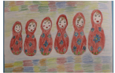
Nour Kiamé (Grade 2 - Level E)