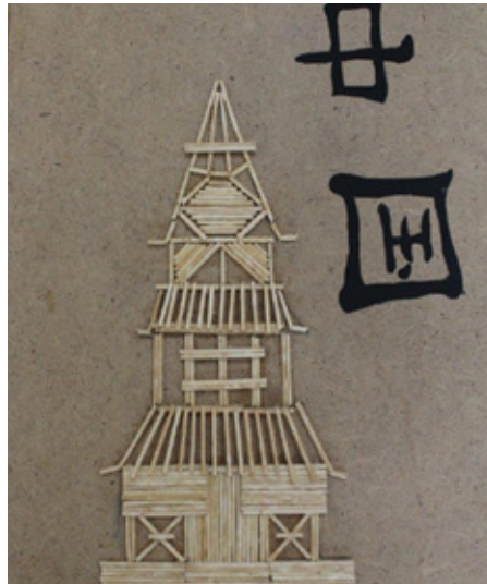
Elie Fakhry (Grade 8 - Level K)