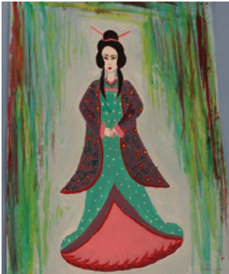
Moufida Barbouj (Grade 8 - Level K)